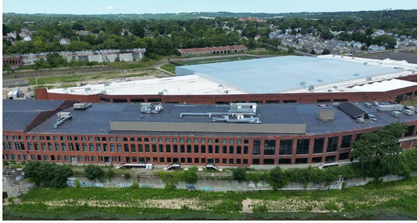
Exterior of entire complex & hotel