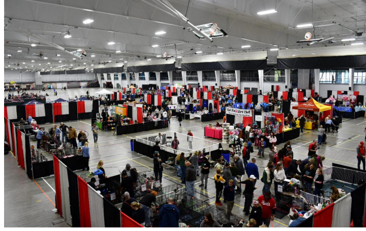
Massive multipurpose space